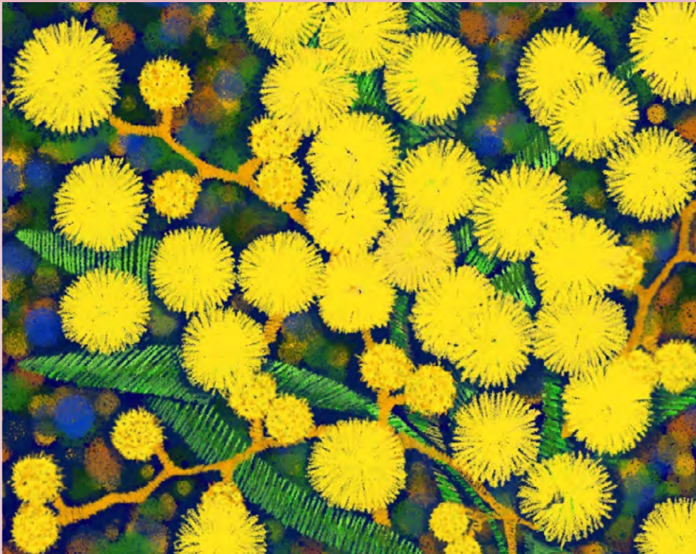
Artwork: Elzette Bester